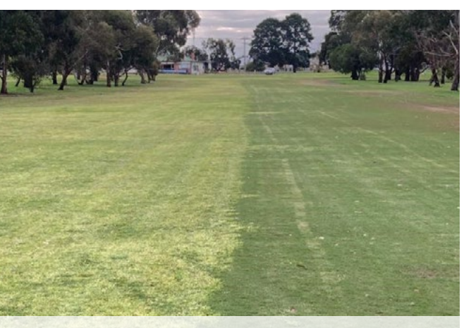
Poa annua control: Untreated vs Treated with BARRICADE® @ 3 L/ha

BARRICADE® and MONUMENT® Herbicide will get your season back on track.